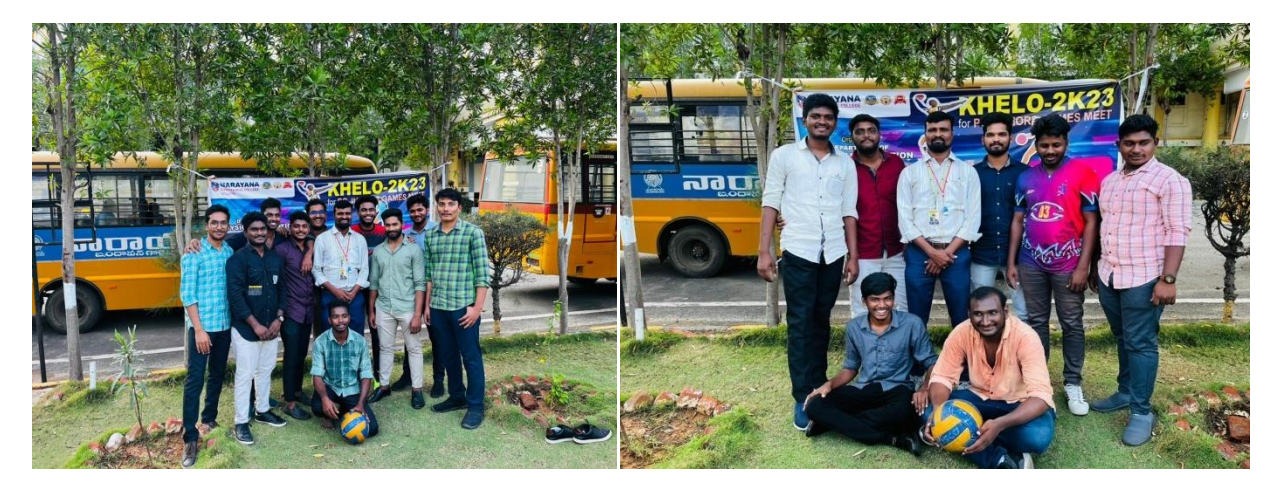
Volley ball Winners & Runners