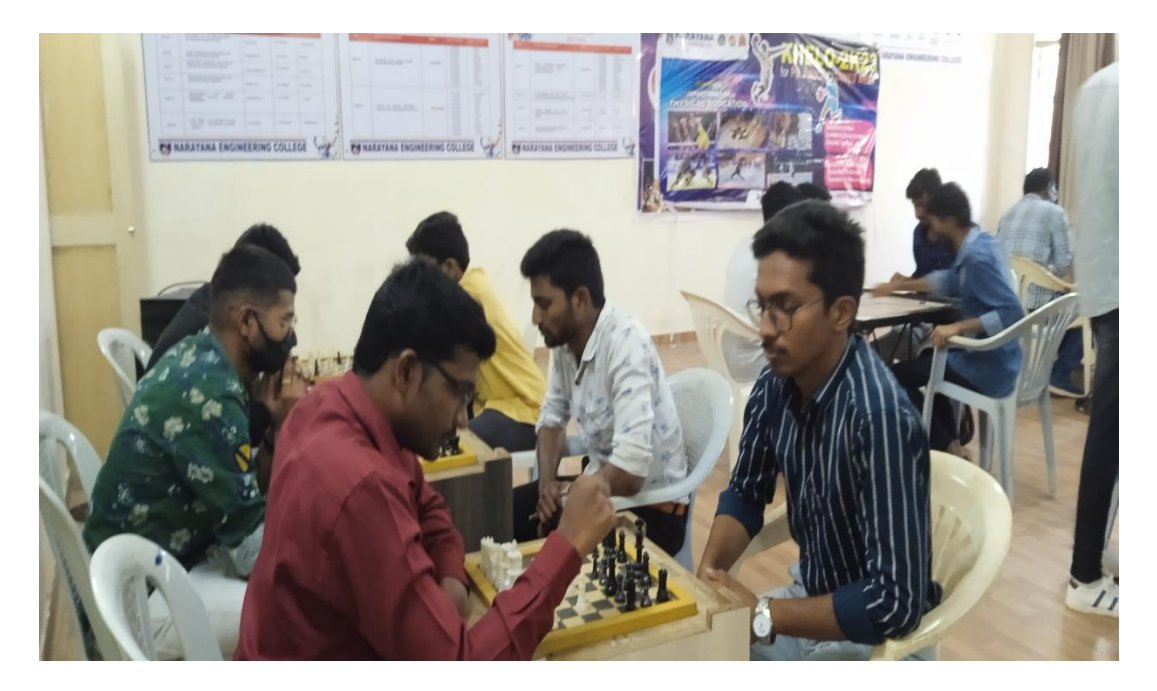
Playing chess and caroms by Boys