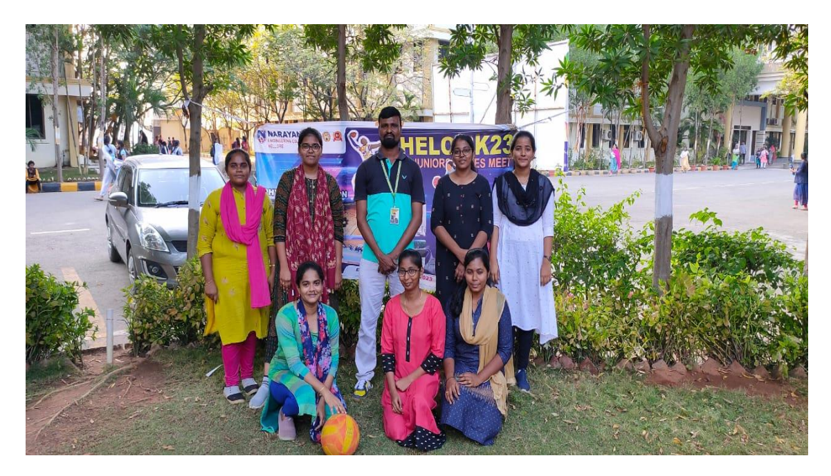
Throw Ball Runners