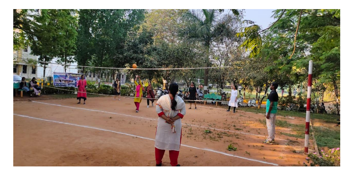
Playing Throw ball Final Match by Girls