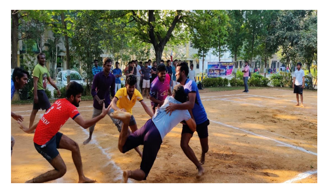
Playing Kabaddi final match by Boys